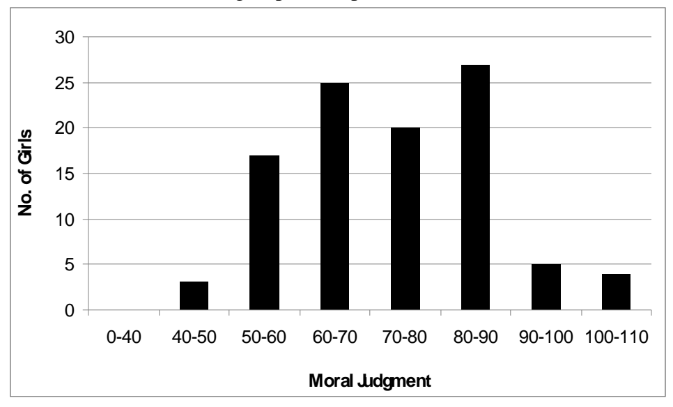
Fig.2 Represents the frequency distribution of moral judgment scores among high school girls

For the sample of girls seen in Fig.2, the scores range from a minimum of 40 on moral judgment to a maximum score of 102. The curve shown, takes an upward trend with most values falling around the mean and then the curve gradually tapers down assuming a bell shaped Gaussian distribution. Once again, we observe that most of them have sound moral judgment skills similar to the sample of boys. The standard deviation of the group is computed to be 14.110.