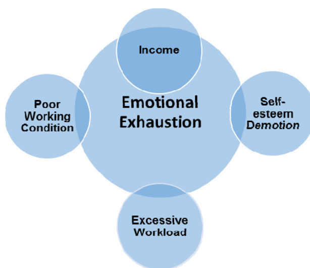
Figure 2: External factors contribution to language teachers` emotional fatigue

Figure 2 pretends to depict the contribution of external factors to the emotional exhaustion of teachers.