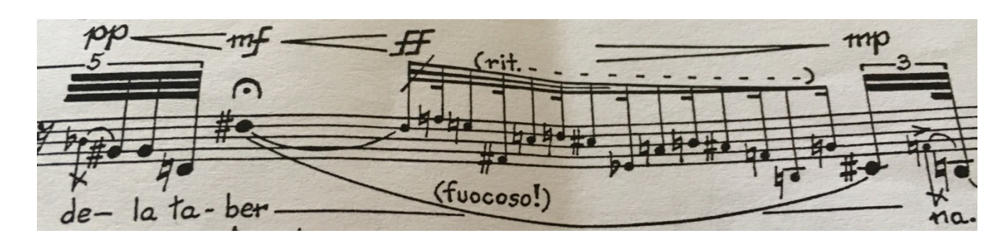
Ex. 1b: A quasi-sequencing passage on "de la taberna" in Madrigal II/2 . Copyright@1971 by C.F. Peters corporation. All rights reserved. Used by permission.